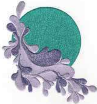
EK012 Transfonges drawing n.06 Medium: Mixed Media on paper Dim: 30 X 20 cm Year: 2025