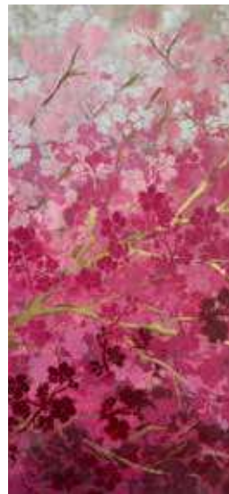
SH07 Komorebi Medium: Mixed media on canvas Dim: 60 x 40cm Year: 2025