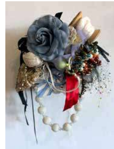
CL09 Nest Bag Medium: Assemblage Dim: 30 x 25 x 20 cm Year: 2015