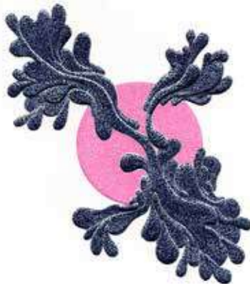
EK08 Transfonges drawing n.02 Medium: Mixed Media on paper Dim: 20 X 20 cm Year: 2025