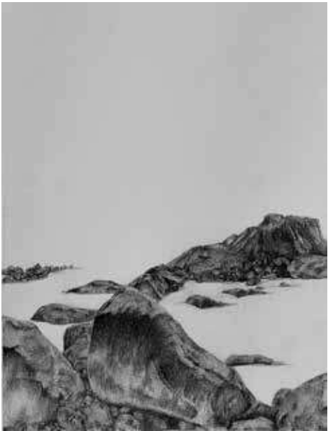
Jl03 Graciosa 3 Dim: 36.4 x 28.5 cm Medium: Graphite on canson Year: 2025