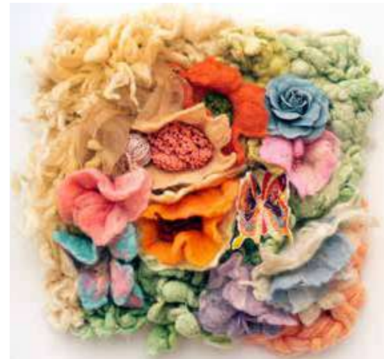
CL05 Azaleas Medium: Mixed Media Dim: 35 x 37 x 5 cm Year: 2022