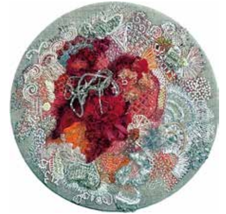
CL08 Fire Moon Medium: Mixed Media Dim: 38 cm Year: 2024