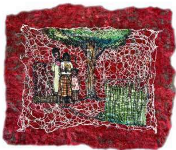
CL04 Lace Garden Medium: Mixed Media Dim: 56 x 63 cm Year: 2024