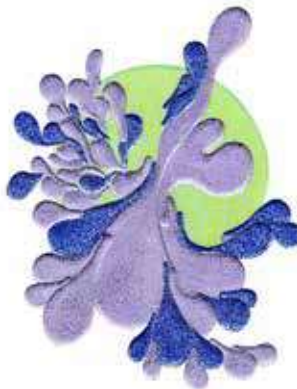
EK013 Transfonges drawing n.07 Medium: Mixed Media on paper Dim: 30 X 20 cm Year: 2025