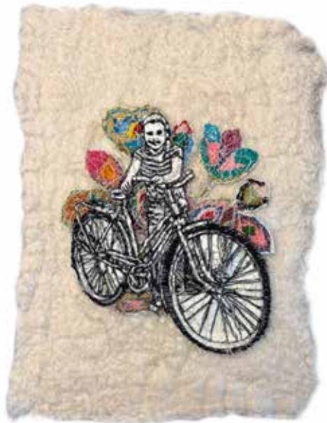
CL02 Aunt's Bike Medium: Felting and embroidery Dim: 36 x 26 cm Year: 2025