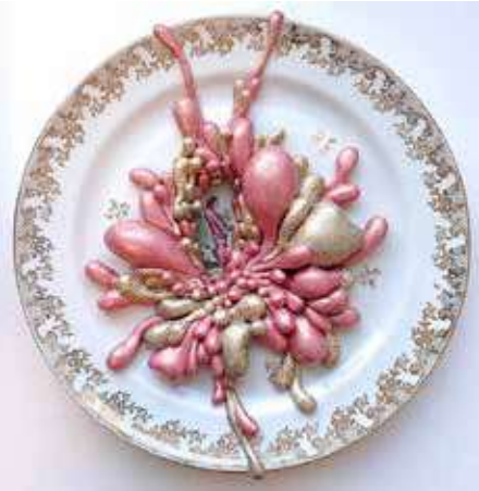
EK06 Transfonges n.08 Medium: Mixed media: Limoges porcelain, polymer clay, bronze and acrylic painting. Dim: 25² cm Ø x 3 cm Year: 2024