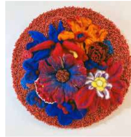
CL06 Flower and Fire Medium: Mixed Media Dim: 40 cm Year: 2023