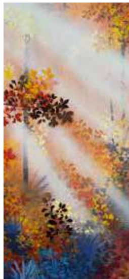
SH06 Komorebi Medium: Mixed media on canvas Dim: 50 x 40cm Year: 2025