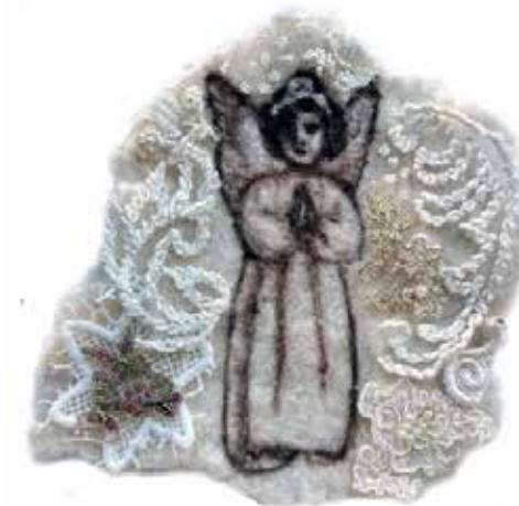
CL10 Wool Angel Medium: Felting and embroidery Dim: 20 x 20 cm Year: 2025