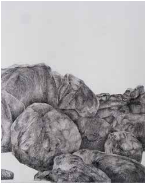
Jl02 Graciosa 2 Dim: 35 x 27.5 cm Medium: Graphite on canson Year: 2025