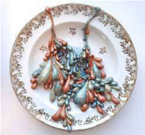
EK05 Transfonges n.06 Medium: Mixed media: Limoges porcelain, polymer clay, bronze and acrylic painting. Dim: 23 cm Ø x 3 cm Year: 2024