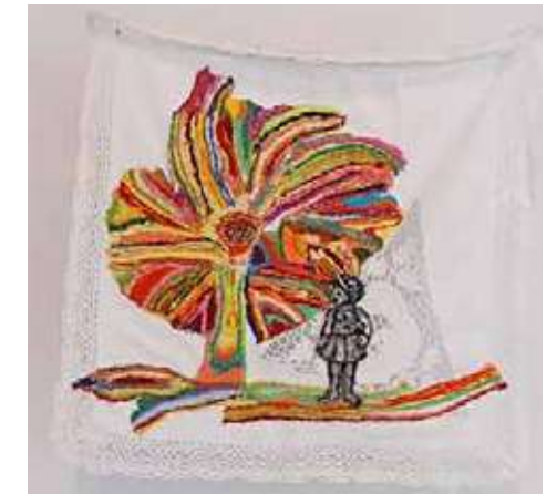
CL11 Pinwheel Tree Medium: Mixed Media Dim: 42 x 42 cm Year: 2023