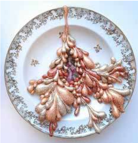
EK03 Transfonges n.07 Medium: Mixed media: Limoges porcelain, polymer clay, bronze and acrylic painting. Dim: 23 cm Ø x 3 cm Year: 2024