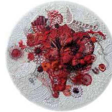
CL07 Fertile Moon Medium: Mixed Media Dim: 38 cm Year: 2024