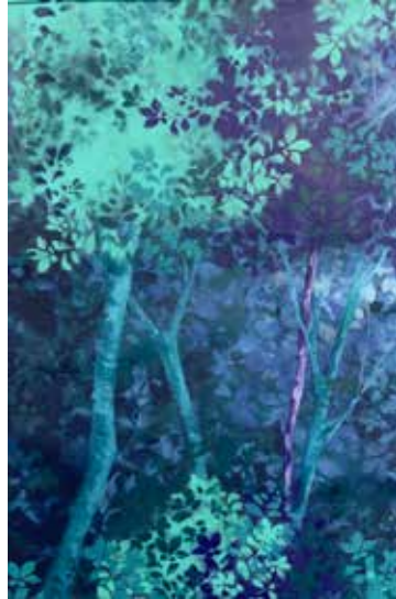
SH02 Vestige of Time Medium: Mixed media Dim: 45 x 30cm Year: 2025