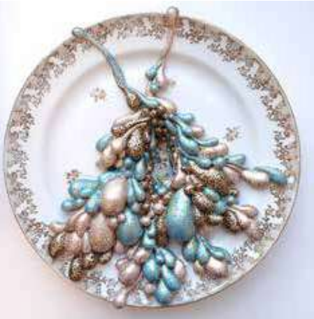
EK04 Transfonges n.10 Medium: Mixed media: Limoges porcelain, polymer clay, bronze and acrylic painting. Dim: 25 cm Ø x 3 cm Year: 2024