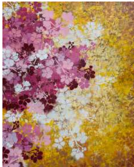
SH05 Sakura Medium: Mixed media on canvas Dim: 50 x 40cm Year: 2025