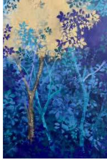
SH04 Vestige of Time Medium: Mixed media on canvas Dim: 45 x 30cm Year: 2025