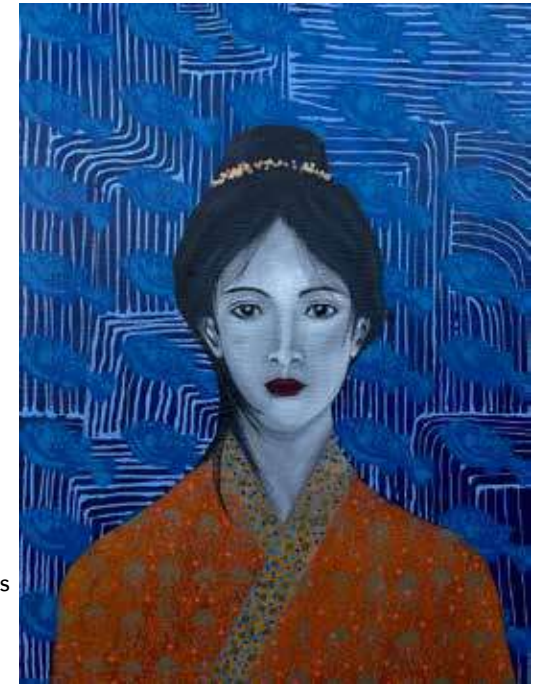
SH11, SH12, SH13 KimonoCan Medium: Mixed media Dim: 19 x 7 cm Year: 2025