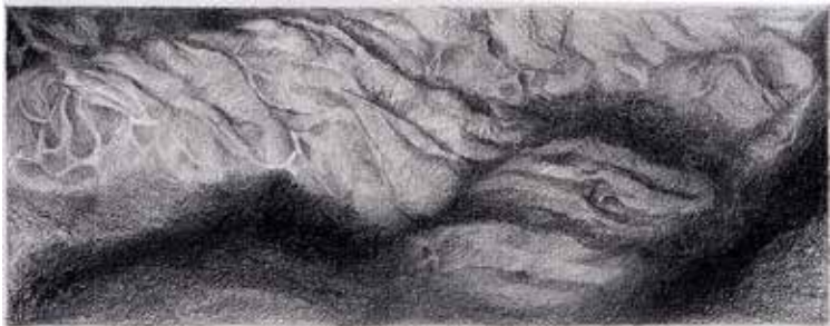
Jl06 Untitled Dim: 25 x 36 cm Medium: Graphite on canson Year: 2016