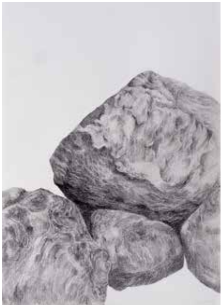
Jl04 Untitled Dim: 42 x 28 cm Medium: Graphite on canson Year: 2016