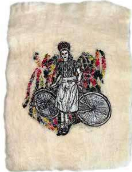
CL03 Party Colors Medium: Felting and embroidery Dim: 36 x 26 cm Year: 2025