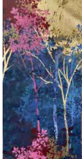
SH03 Vestige of Time Medium: Mixed media on canvas Dim: 60 x 30cm Year: 2025