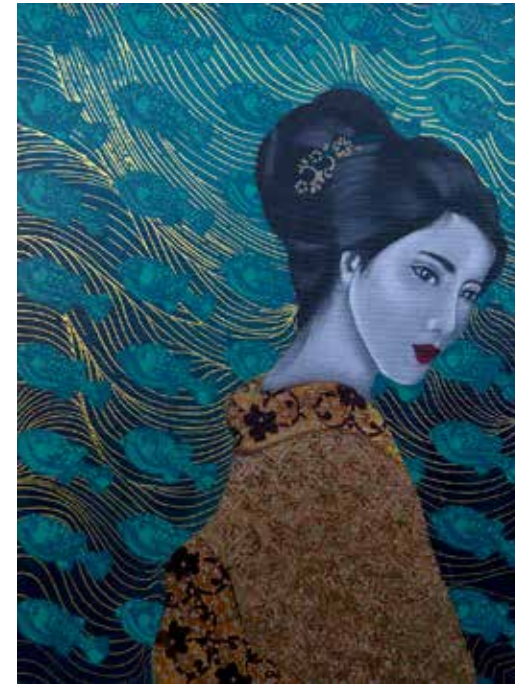
SH08, SH09, SH10 Say hai - Tai Medium: Mixed media on canvas Dim: 60 x 45cm Year: 2025